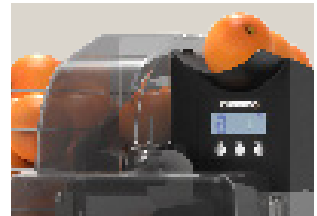
Standard Contact Sensor

The machine automatically starts up when the Contact sensor, included as standard equipment, detects the oranges on the ramp. It will also stop automatically when there are no oranges on the ramp, at which time the juicer goes into standby mode.