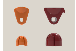
Juice extraction kit

Medium(M): Orange; Optional- Large (L): Maroon.